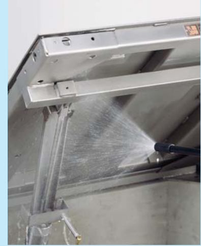
The EZ-CLEAN scale tilts up 45 degrees to expose the underside and pit for washdown.