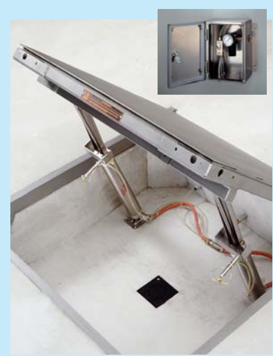
Pneumatic control and cylinders automatically lift the EZ-CLEAN scale for cleaning.