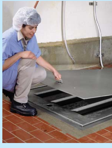
The EZ-LIFT scale has gas-pressurized struts that make it easy to lift the platform for cleaning.